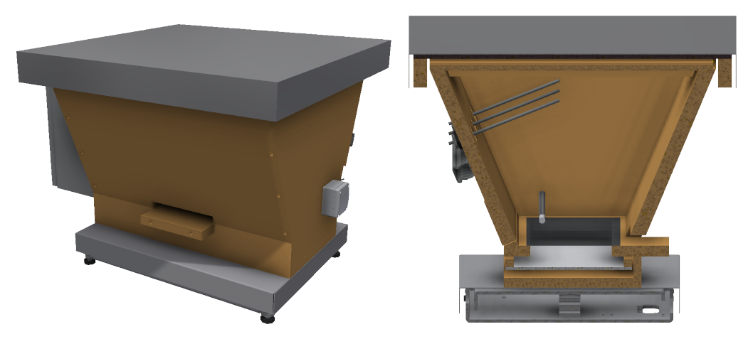
(a) eHive 0.2.2