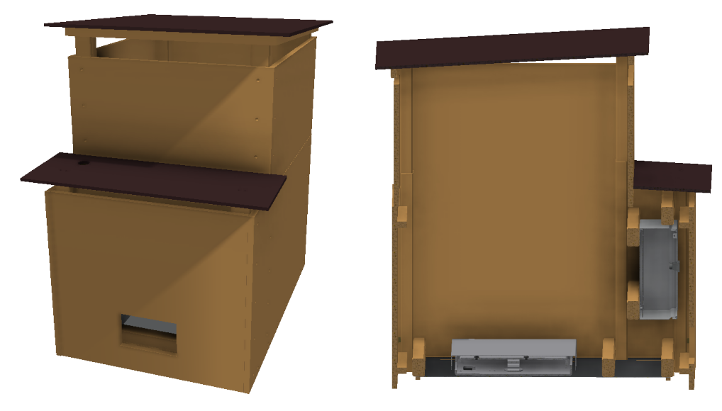
(c) eHive 1.2 (without inner hive)